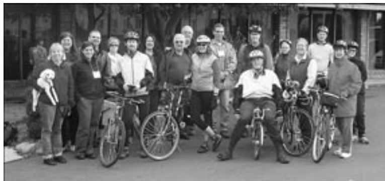
Above: A group of delegates from the conference sets out on bike and foot to view portions of the proposed William O. Douglas trail route

assets as the Greenway has done and will continue to do.