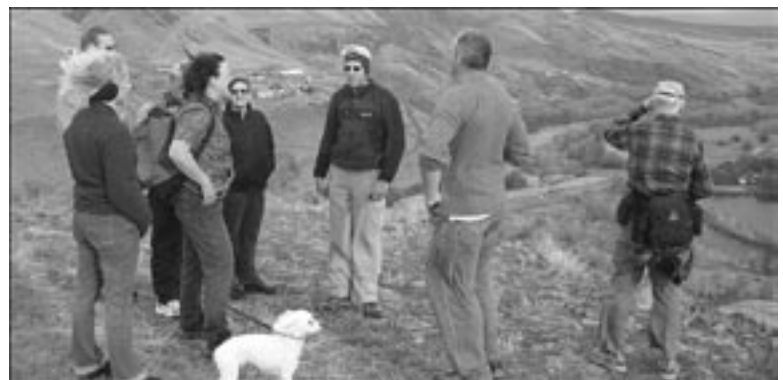
Right: Standing on the ridge where Justice Douglas walked as a boy