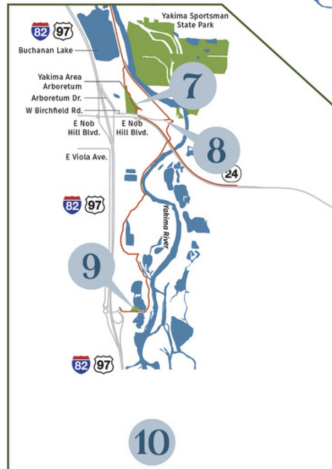
1 Mile Mileage Scale